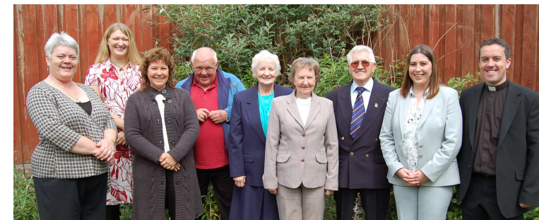
Committee Members and Staff at the Launch of Maybole One Stop Shop

Since we opened the service has developed links with a number of agencies and outreach services. We want to make sure that as many people as possible are aware of what we have on offer and can refer clients.