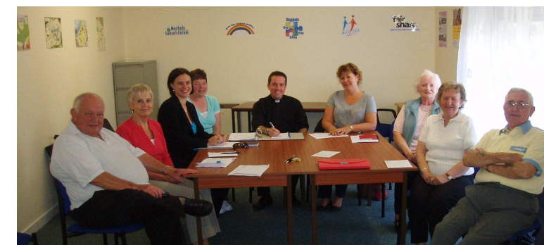
The MOSS committee meeting in the newly refurbished Over the Rainbow premises.

The premises have been refurbished and have meeting space, a smaller private room and toilet facilities. They can be booked for evening and weekend use by contacting MOSS and completing a booking form.